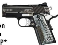
Limited Edition Kimber Ultra Carry II .45 ACP*