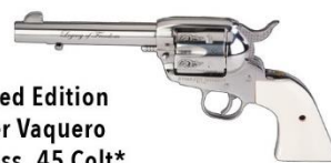
Limited Edition Ruger Vaquero Stainless .45 Colt*