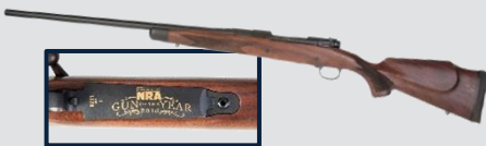
Montana Rifle American Legends .300 Win Mag Rifle Gold Cerakote Embellishment and Custom NRA Serialization